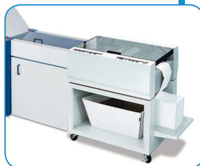
FD 2380 with in-line FD 676 Burster