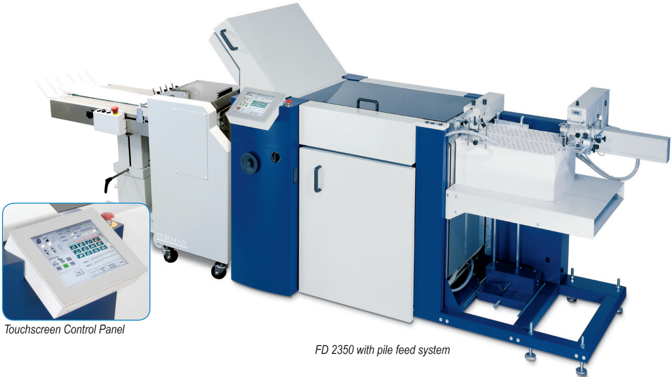
Touchscreen Control Panel