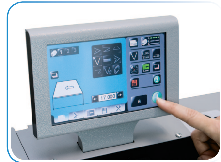
Color touchscreen control panel

* Speed varies depending on paper weight