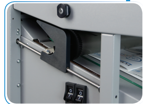
Automatic outfeed rollers