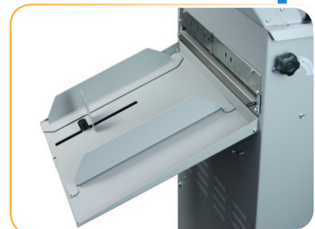
Perforation / score attachment, included