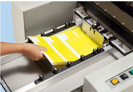
Bottom-feed air system for continuous loading of cut-sheet forms