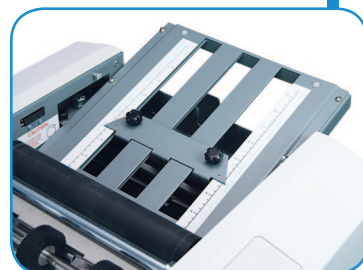
Clearly marked fold plates are easy to adjust