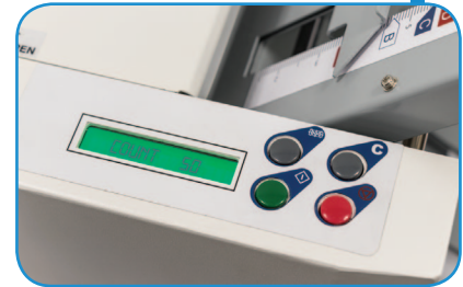
LCD control panel with resettable counter