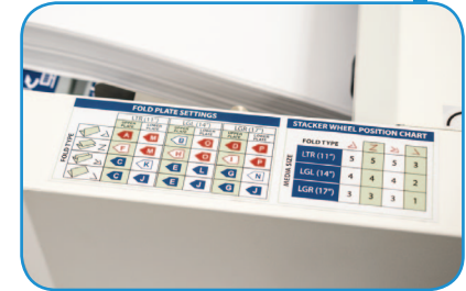
Fold guide icons match those on the fold plates, for intuitive, easy setup