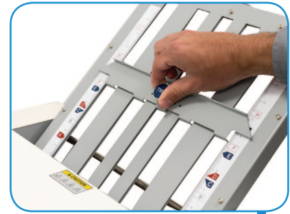
Clearly marked fold plates and quick-release fold stops make setup a breeze