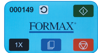
Touchscreen Control Panel