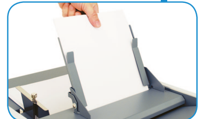
Optional Multi-Sheet Feeder