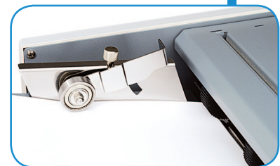
Cross Fold Guide

Formax – New Hampshire, USA www.formax.com