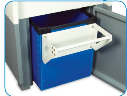
Rugged molded plastic waste bin on casters for easy removal