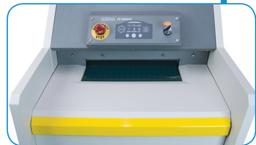
Large infeed table with conveyor belt, and safety bar for immediate shut down