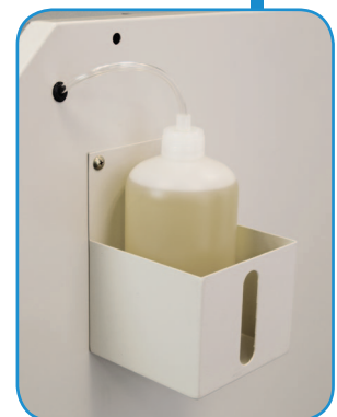
EvenFlow™ Oiling System Reservoir Bottle