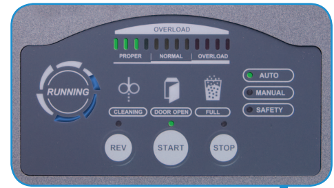
User friendly LED control panel with visual load indicator

* Sheet capacity may vary due to variations in paper and power supply.