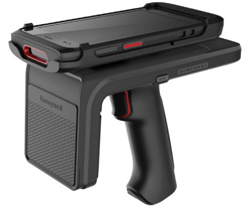
The Honeywell IH25 handheld RFID reader enables fast and accurate UHF RFID inventory capture for supply chain and retail inventory applications

The new Honeywell IH25 RFID reader, combined with RFID tagging, offers an easier solution to keep track of high moving inventory with less effort. Retailers can count inventory in the store and warehouse 25 times faster than with barcodes, often in a matter of a few hours, enabling more frequent inventory updates and closer management of inventory levels. Easy to use and ergonomically balanced, when paired with a Honeywell mobile computer, the IH25 offers fast, accurate UHF RFID inventory capture and convenient, integrated 1D/2D barcode capability.