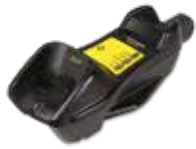
BC9130-BT Base/Dual Charger, Multi-Interface BC9180-BT Base/Dual Charger, Multi-Interface/Ethernet (Standard, Industrial)