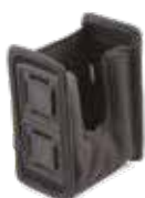
HLS-P080 Universal Holster (HLS-8000)