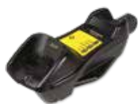
BC9030-BT Base/Charger, Multi-Interface