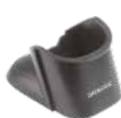
HLD-P080 Desk/Wall Holder (HLD-8000)