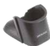
HLD-P080 Desk/Wall Holder (HLD-8000)