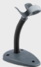
• STD-QD24-BK Stand, Black