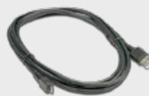
• 007100100 Direct Charging Cable