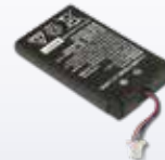
RBP-DBT6X RBP-6400 Removable Battery Pack