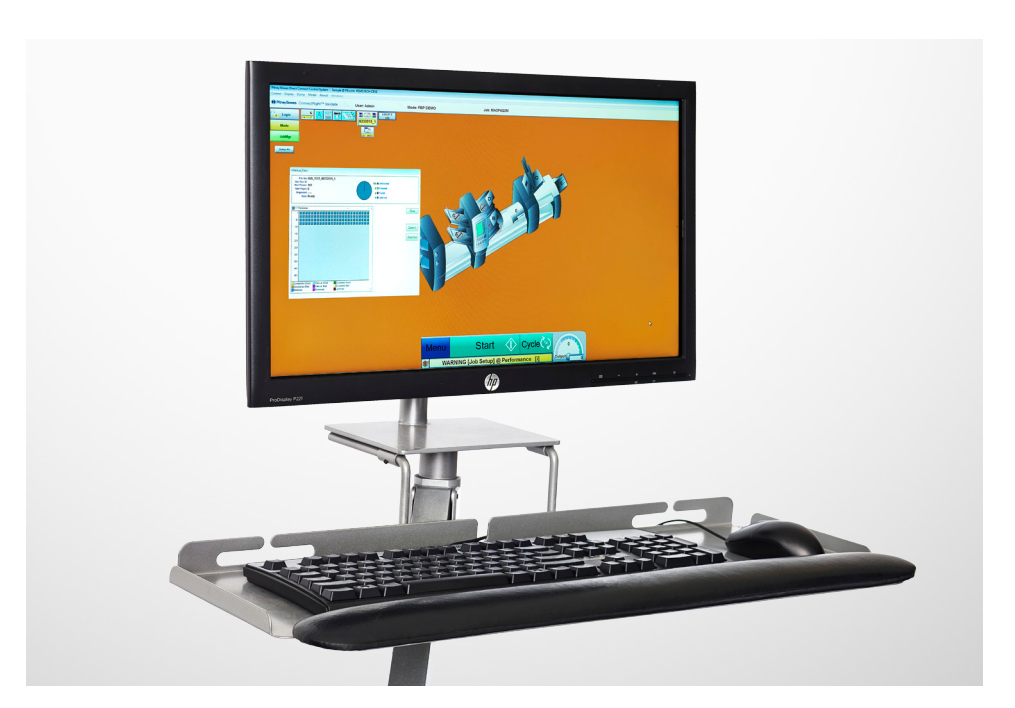
Validate every page of a mailing against the intended mail file automatically with file-based processing.

You shouldn't have to tailor your mail programs to the limitations of your equipment. The Relay 7000/8000 inserters provide the flexibility to insert pages into letter-sized or flat envelopes in the same mail run without stopping the machine. Even better, setup is easy and fast.