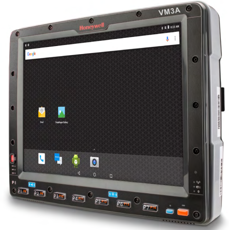
The Thor VM3A full-sized, vehicle-mounted computer delivers unmatched operational efficiencies in the toughest distribution center environments.

The Smart Dock feature delivers immediate savings on support and maintenance costs while maximizing efficiency, enabling users to quickly shift computers as vehicles fail or workloads change. The field-replaceable front panel allows enterprises to minimize investments in spare parts by substituting low-cost spare front panels for spare computers and saves valuable time and maintenance costs by leveraging in-house staff to service touchscreen or keyboard failures.