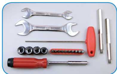
Complete tool kit for adjustments, blade changing and general maintenance