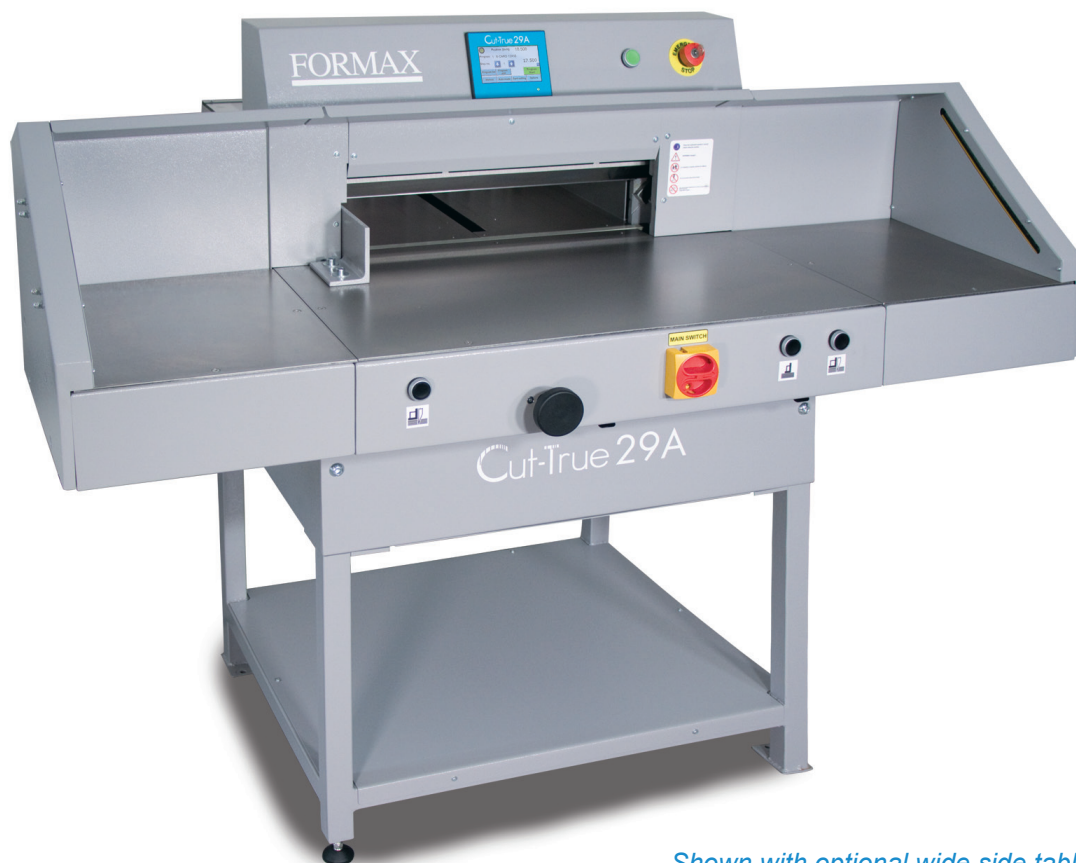
Shown with optional wide side tables

The Formax Cut-True 29A Electric Guillotine Paper Cutter offers precision cutting for paper stacks up to 20.5" wide. User-friendly, intuitive features include a touchscreen control panel, automatically-adjusting back gauge and the capacity to program up to 100 jobs/100 cuts . An infrared light beam safety curtain provides safety and convenience as it shuts down operation if the light plane is interrupted.