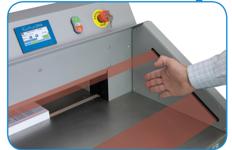
Infrared Safety Curtain shuts down operation if the beam is interrupted