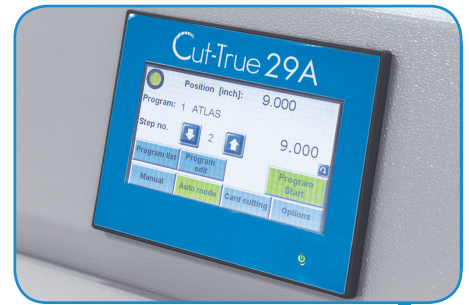
Full-color touchscreen control panel allows for programming up to 100 jobs

* 31"W with safety curtains removed for easier transport through doorways. 33.5"W including safety curtains.