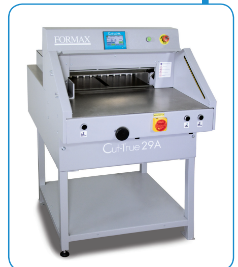
Standard model, without optional wide side tables

Formax - New Hampshire, USA www.formax.com