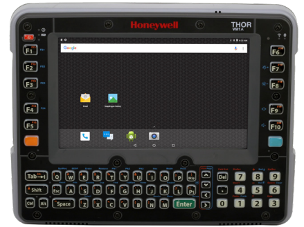
Built on the future-proof Mobility Edge platform, the Android-based Thor VM1A vehicle-mounted computer is built tough to handle harsh warehouses, ports and intermodal and manufacturing environments.

The Smart Dock feature delivers immediate savings on support and maintenance costs while maximizing efficiency, enabling users to quickly shift computers as vehicles fail or workloads change. The field-replaceable front panel allows enterprises to minimize investments in spare parts by substituting low-cost spare front panels for spare computers, and saves valuable time and maintenance costs by leveraging in-house staff to service touchscreen or keyboard failures.